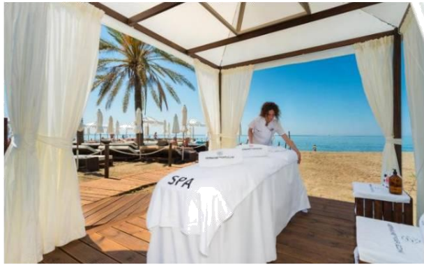
A beach-side massage perhaps?