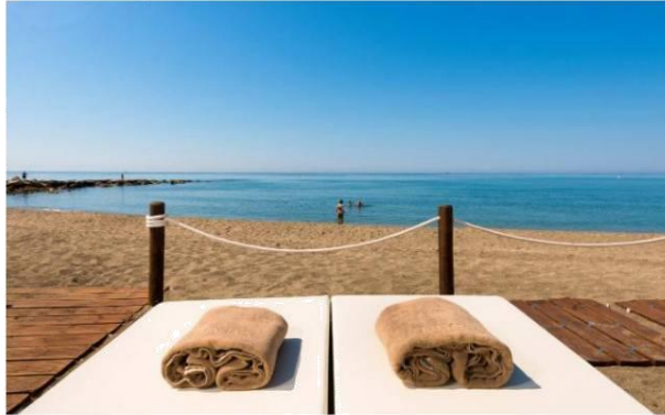
A Marbella beach spa hotel that's full of surprises