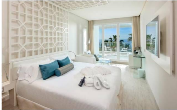
Amare's ethos of calm is perfectly reflected in its rooms

Having dined on an abundance of fresh fruits and salads during her stay, exempting the odd pampering cocktail on the impressive rooftop panoramic bar, Spy feels fully detoxed and refreshed. A spa beach hotel, Spy considers, is an excellent antidote to stressful thoughts - coupled with plenty of sleep in her serenely appointed sea-view room.