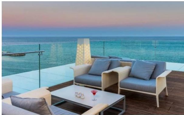
A cocktail on the rooftop bar before hitting Old Town is much needed

Spy admits to being initially sceptical that Marbella would fulfill her needs of a relaxing weekend getaway but from the moment she stepped into the Amare's bright and airy lobby, her preconceptions were challenged and popped as if a floating bubble. Amare's smilingly attentive white-clad staff only added to Spy's sense of contentment and relaxation, never failing to satisfy queries and questions and even providing bicycles for an early morning promenade cycle. Spy will be returning when next she is in dire need of sun, sea and spa within short hours of grey and stressful London.