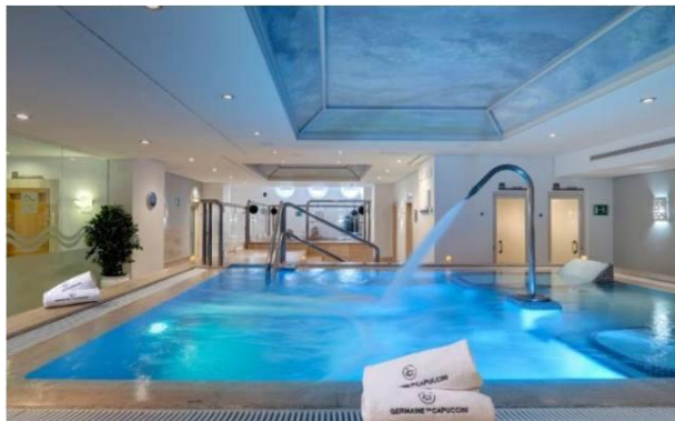
The spa is a welcome retreat from the Costa del Sol

Here, various magical potions of pleasing consistency are massaged onto Spy's body with a delicate firmness, suited for sun parched limbs. As a light face mask is gently massaged on to Spy's face, she reflects on the possible curative effects of a good moisture bath and is optimistic for the recuperation of her freckled face.